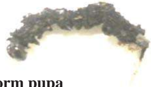
Infected caterpillars unable to form pupa