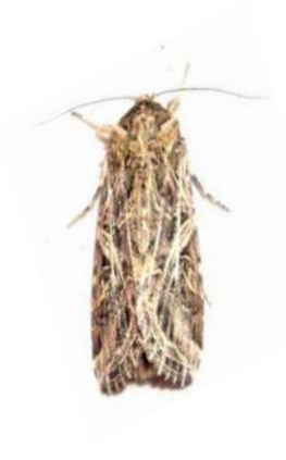
Oriental leaf worm Spodoptera litura