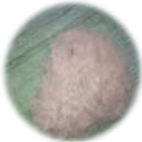
Eggs of fall armyworm Spodoptera frugiperda

Egg mass of fall armyworm is difficult to distinguish from other two related worm/moth species commonly found on maize. Fall armyworm eggs are laid in mass inside the whorls or on undersurface of leaf or on stem. Eggs may be laid on single or multiple layers. Eggs are creamy colored with anal tuft of hairs or sometimes without hair covers