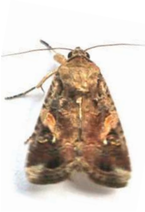
Fall armyworm (Male) Spodoptera frugiperda

How it differs from other related worms feed on maize crops?