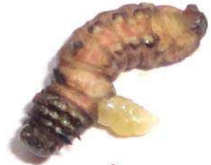
Parasitized S. litura larvae by Chelonus formosanus