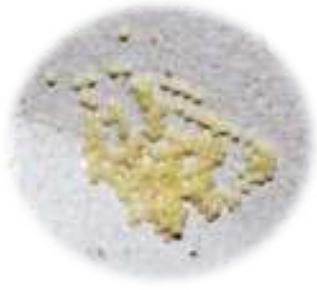
Eggs of Oriental armyworm Mythimna separata