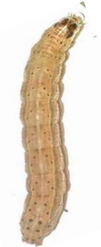
Fall armyworm Spodoptera frugiperda

How it differs from other related worms feed on maize crops?