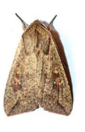
Oriental armyworm Mythimna separata