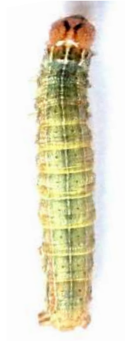
Oriental armyworm Mythimna separata