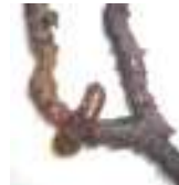
Baculovirus infected larvae