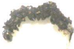
Bt infected caterpillars