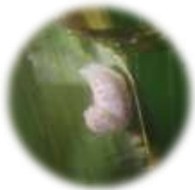
Grub of Ichneumon wasp