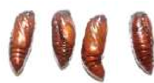
Healthy pupae of FAW