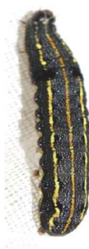
Oriental leaf worm Spodoptera litura