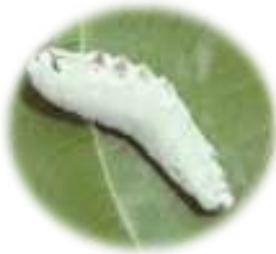
Metarhizium (= Nomuraea ) rileyi