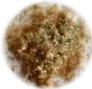
Eggs of Oriental leaf worm Spodoptera litura